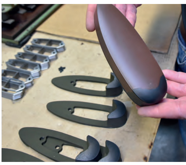
The recoil pad: A composite part made of hard rubber, stainless steel and soft rubber.