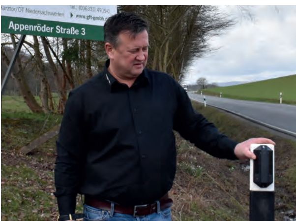
The inventor together with a mounted "Wildwarner".