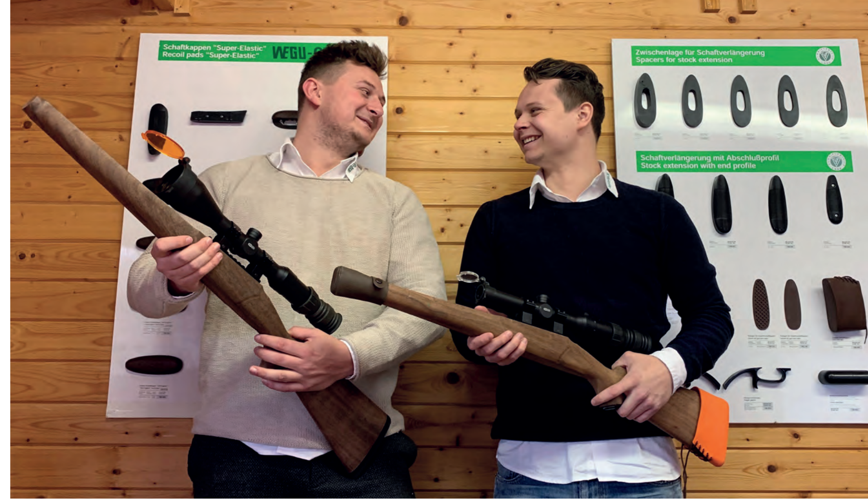
The sons also already work for the company.