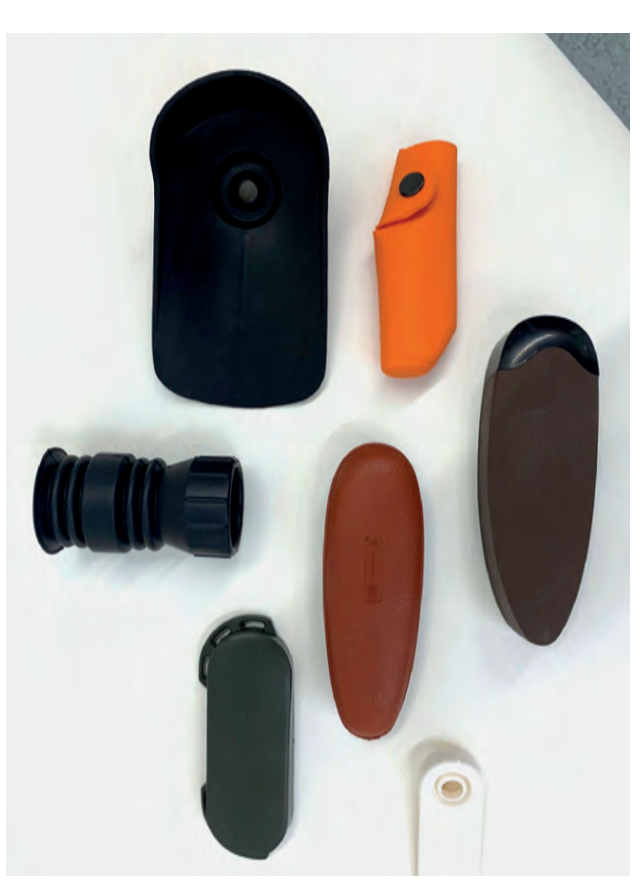
Collection of products in various colors

For the IM, CM and TM processes, GFT chooses MA-PLAN machinery. The company uses the equipment for various production processes. Two to three change-overs a day are on the agenda. Flexibility is Drochelmann's foundation for success. GFT is a niche supplier: Rubber-metal compounds, where the metal part is coated and encapsulated with rubber, as well as the processing of sophisticated materials are integral to everyday production.